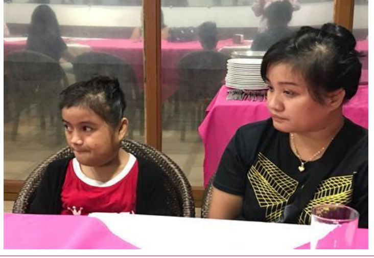
The Rotary Club of Downtown Butuan meets every Friday, 6:30 pm at Kapihan sa Balanghai, Balanghai Hotel, Butuan City